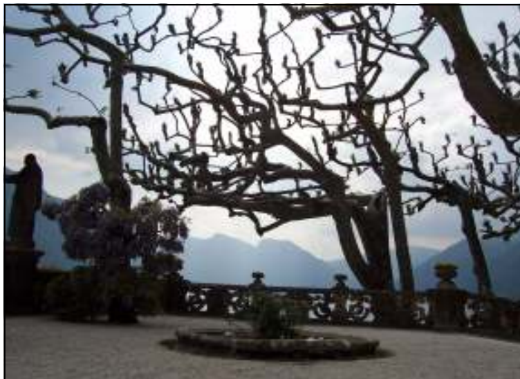
Déjà vu with a twist!!-above, May 2006, and below, September 2000 respectively. With added droids, too!!

Gigliola had previously arranged boat transport to the amazing, wonderful, beautiful Villa the second we that had from our hotel, goose bumps was just magical as I once we instinctively, I the wedding about a dozen could even anywhere else. crook in that the exact spot. pointed out that balustrade/ owner had that is repeated perimeter of