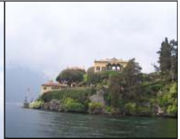
Two shots taken from the lake of the beautiful Villa Balbianello. A true STAR WARS pilgrimage!!

up at the hotel and chauffeured us around the Star Wars sites) we were at last off to the Villa.