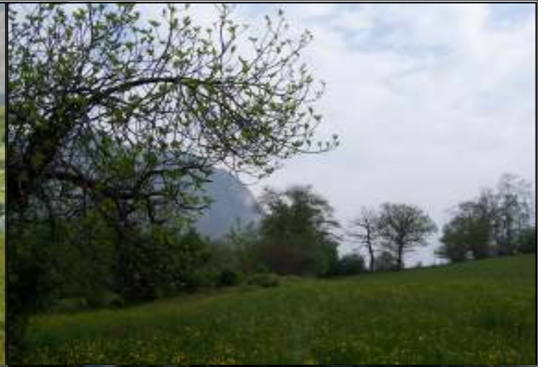
Above top right and left: A Field of Dreams—soon to be “developed.” Future visits will require the aid of CGI from INDUSTRIAL LIGHT AND MAGIC. Opposite right: George Lucas supervises the picnic scene with Hayden and Natalie.