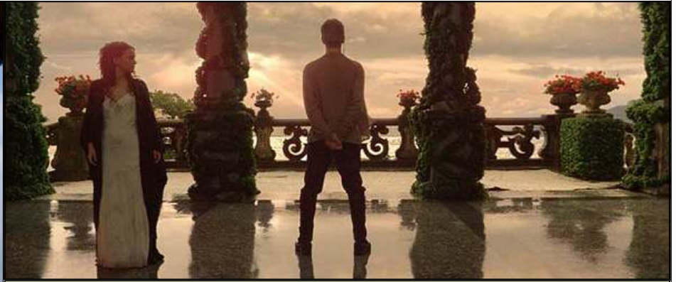
Opposite left: The triple-arched loggia always triggers a Vader stance from STAR WARS fans. Above: the original shot from ATTACK OF THE CLONES. Below right: Feeling that he could see the initials A and P in the location's symbol, George decided not to CGI remove it from the finished movie.

talking and also the room that served as Padme's bedroom.