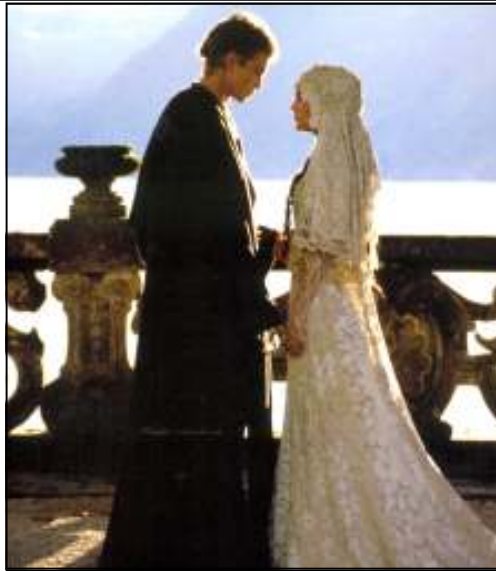
A rainbow appeared during the filming of the wedding scene. It had rained incessantly the day before and was still raining that morning. And then...magic!!