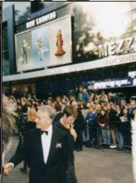
Above far top: fans enthusiastically cheer the Premiere arrivals. Above top: Ray Park, with his gorgeous partner, in line to enter the cinema says hello to the fans. Top left: Peter Mayhew joins Mr and Mrs Kenny Baker for a photo opportunity. Above: Anthony Daniels (with two Threepio HASBRO figures in his tuxedo front pocket!!) meets the fans. Opposite left: two cinema-goers indulge themselves in a little STAR WARS fancy dress for the occasion.