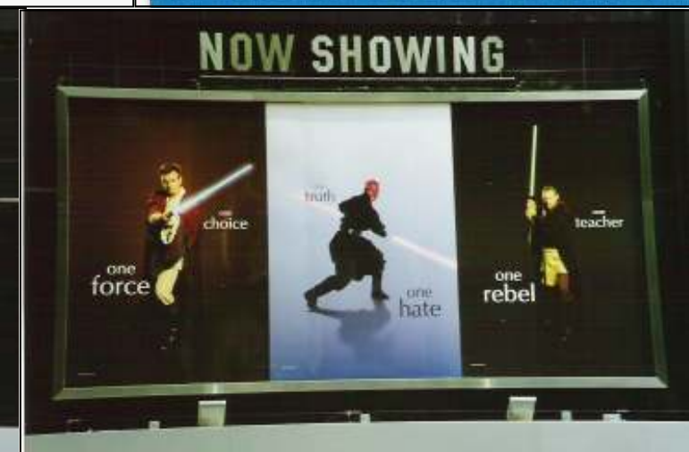
Above: the back of the lovely ticket for the 1999 Royal Film Premiere-with a hologram Darth Maul face no less!! Opposite left: six of the brilliantly conceived character marketing campaign posters displayed outside the ODEON, developed for use world wide by LUCASFILM to promote the long awaited return of the STAR WARS SAGA with THE PHANTOM MENACE. Which one is your favourite?