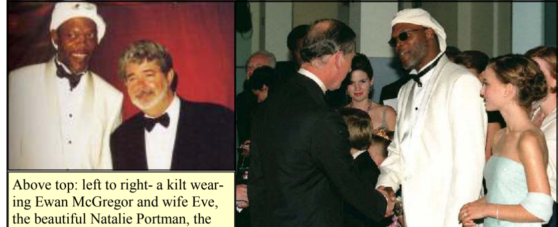
Above top: left to right- a kilt wearing Ewan McGregor and wife Eve, the beautiful Natalie Portman, the charming Ahmed Best. Above: Lucas and Sam (the Man) Jackson share some laughs for the camera. Opposite right top: Prince Charles meets Sam and Natalie. Opposite right: Prince Charles talks film with George Lucas. Below: the EPISODE ONE cast and crew gather to introduce the movie.