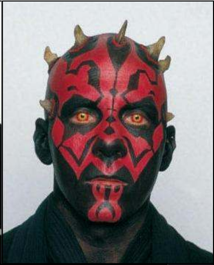
Far left: Ray Park as he was in the late nineties. Middle: close-up look at the horn applications to Park's head. Opposite left: a chilling shot of the malevolent Dark Lord in all his un-apologetic glory.