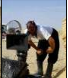
Above far left: Darth Maul falls for a shot to be superimposed into the Theed reactor room action sequence. Middle left: has Tunisian fun on a trampoline. Middle right: on his imaginary speeder bike. Right: his directorial debut!!