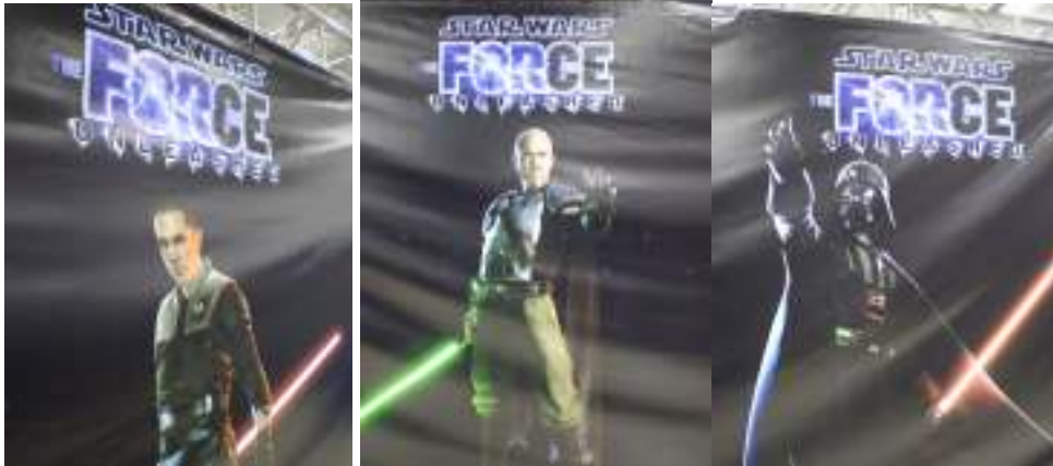
Promotional banners depicting characters from the game. Starkiller: Vader's Secret Apprentice, General Rahm Kota and Darth Vader.

As well as many of the actors and game developers attending, the very special guest was none other than Mr George Lucas.